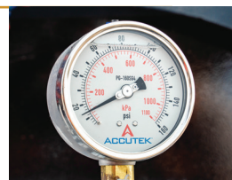
4" load scale gauge